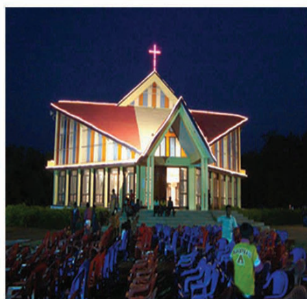
St., Marris Church Manvi