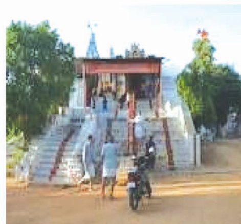
Sri Anjaneyya Swamy, Panchamukhi.