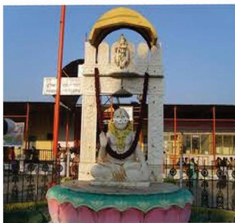
Sri Raghavendra Swamy Mantralaya