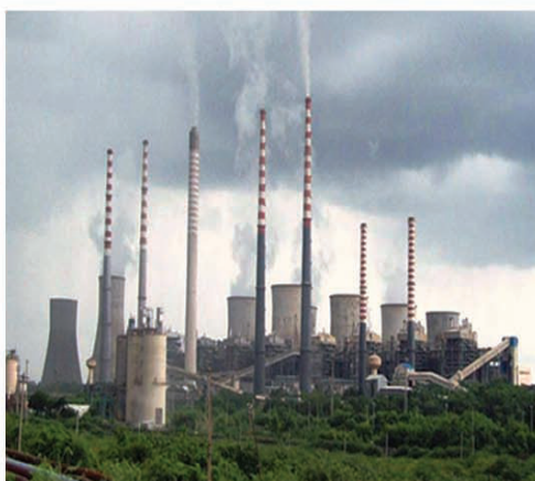
RTPS Shaktinagar, Raichur.